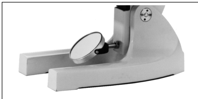
Models 106, 107 & 108 supplied with substage mirror.